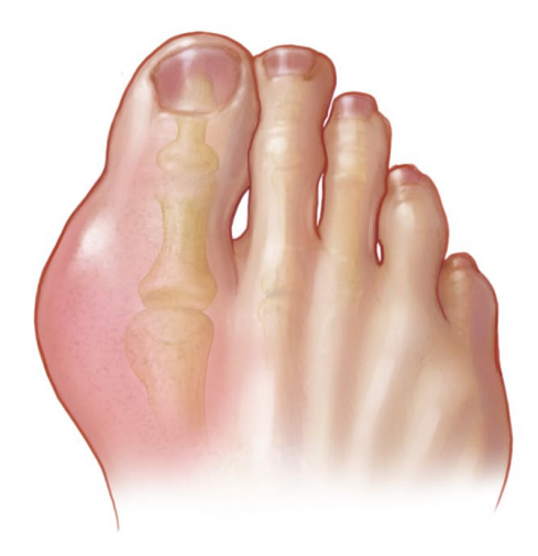
Fig.1: Gout [5]

With the onset of gout, one may be unable to move the joints as usual.